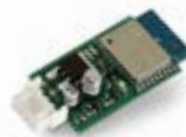
250T-WIFI Device for Wi-Fi connection 2,4 GHz to allow the smartphone to remotely control and program the control units via TauApp