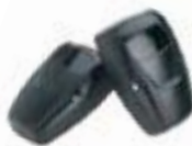
900OPTIC Set of infrared safety photocells, 12/24 V, surface mount, beam alignment adjustable up to 15°, up to 20 m range