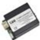
250T-CONNECT NEW Ethernet + Wi-Fi device - to enable through Tau Open application, the use of the smartphone remotely, to open/close and check the status of the gate