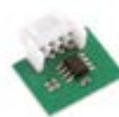
250SM126 Memory card for 126 radio codes