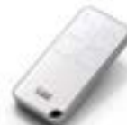
250S-4RP Four-channel transmitter, rolling code technology, 433,92 MHz