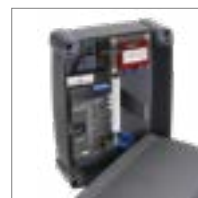
Accessories for ZIPPO series Page 126

DC electromechanical gate operator. Maximum gate leaf 4 m.