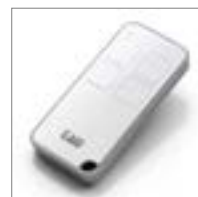
Further accessories: Transmitters page 234 Photocells page 239 Flashing lights page 242