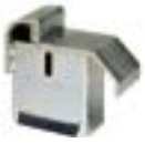
700BAP Gate stopper for heavy leaves