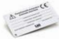
C-TARG C-TARG Aluminium CE Mark Label, self adhesive