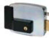
650ESV1-2 Vertical electric lock recommended for leaves longer than 3 m (1=LEFT - 2=RIGHT)